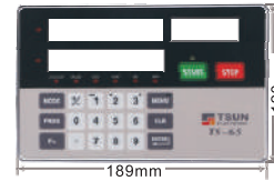
正视图 Front view